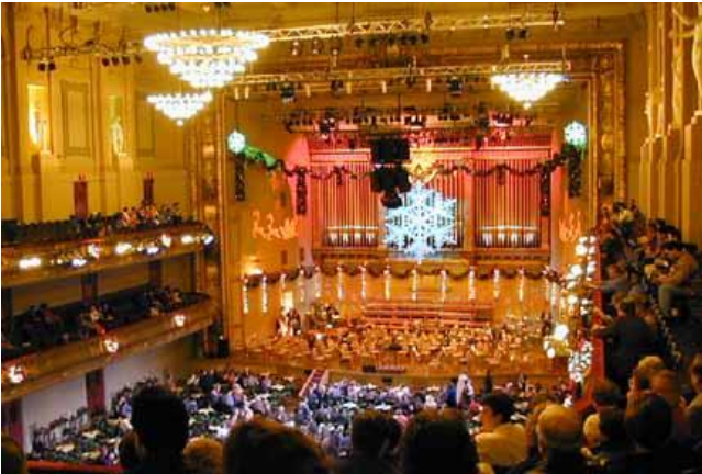
SYMPHONY HALL O. W. Norcross, Builder