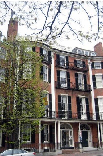
COLBURN HOUSE Asher Benjamin, Architect