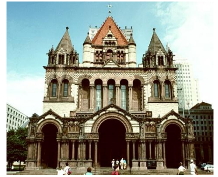
TRINITY CHURCH O. W. Norcross, Builder