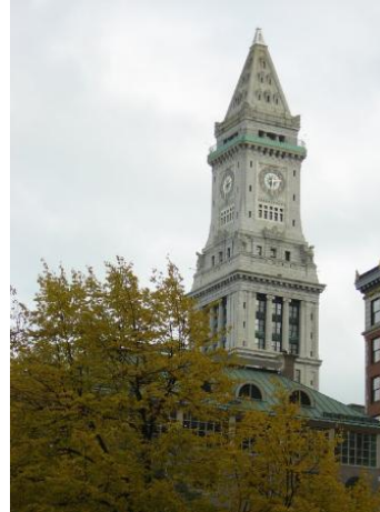
CUSTOM HOUSE Base: Ammi B. Young , Architect Tower: O.W. Norcross , Builder