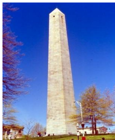
BUNKER HILL MONUMENT Soloman Willard , Architect