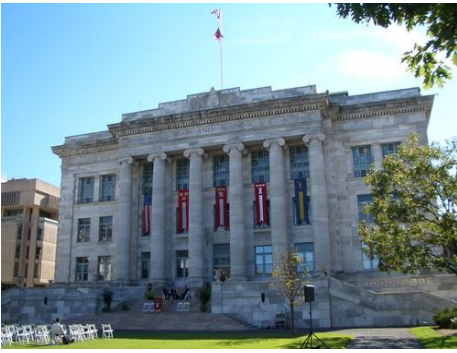
HARVARD MEDICAL SCHOOL O.W. Norcross, Builder