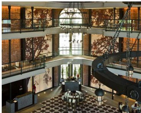
CHARLES STREET JAIL (now The Liberty Hotel) Gridley J. F. Bryant, Architect