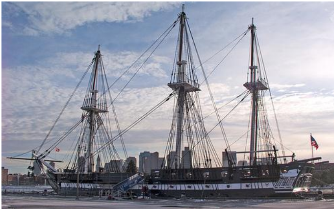
U.S.S. CONSTITUTION Edmund Hartt, Shipbuilder

We're into "Tourist Season" in Boston, and we thought this might be an appropriate occasion to recall that MCMA members have been responsible for a great many of the sights, attractions and places of interest that draw people to this city. So, next time you have occasion to visit Boston with family or friends, don't hesitate to take credit for MCMA Boston . As usual, we have bolded the names of the key MCMA members associated with each of these attractions, but keep in mind that many other members were involved as subcontractors or craftsmen as well.