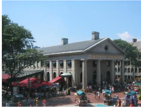
QUINCY MARKET Alexander Parris, Architect