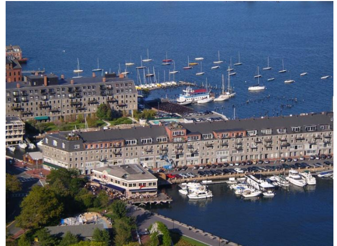
COMMERCIAL WHARF Isaiah Rogers, Architect