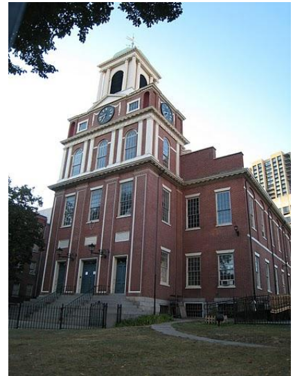
OLD WEST CHURCH Asher Benjamin, Architect