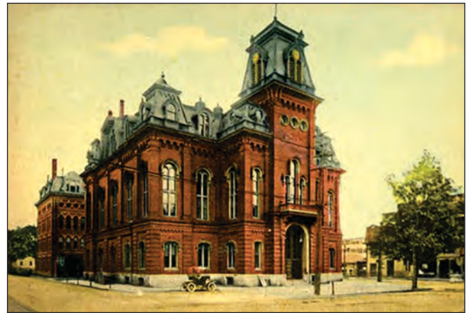
Wakefield (Mass.) Town Hall (1871) (Early 20th-century postcard view)

Without question Cyrus Wakefield was a talented and energetic man who recognized his opportunities and made the most of them. But he also appreciated the support he had received at every turn from the town of South Reading, and he in turn supported many of their projects. In 1867, in response to a Town effort to construct a memorial to its Civil War dead, he pledged a parcel of land and $100,000 to construct a new building (it became the Town Hall) that would house the memorial. In gratitude, and much to Cyrus' delight, the townspeople voted to change the name of the town to Wakefield. He joined our Association in 1851 as a manufacturer, was active on committees, and served two terms on our Board of Government. As Ray Purdy liked to remind us, we should not pass through the Town of Wakefield without recalling that it is named for a member of the Massachusetts Charitable Mechanic Association.