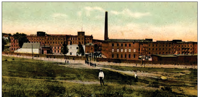
The Wakefield Rattan Factory, Wakefield, Mass. (Early 20th-century postcard view)