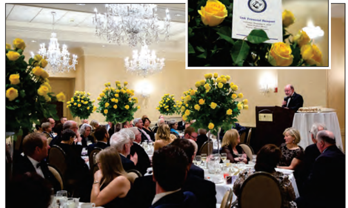
MCMA Triennial Celebration, Omni Parker House Hotel, December 8, 2018