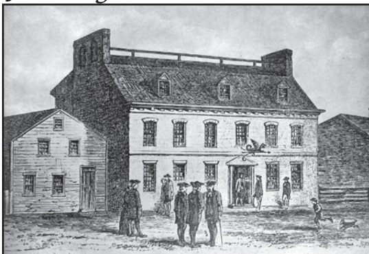
Birthplace of the M.C.M.A. ~ March 15, 1795